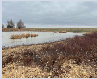
A sink hole developed at the site of an unplugged disposal well at the French site in Stafford County. The site is classified as moderate-high immediacy.

The KCC Conservation Division manages an inventory of contamination sites that have varying degrees of impact to groundwater, surface water, soil or wells. These sites have no responsible parties related to oil and gas exploration and production activities. The current evaluation period, January 1, 2021, through December 31, 2021, ended with no sites resolved or added, resulting in a total of 47 active sites. The 2022 Remediation Status Report to the Legislature contains a description and evaluation of each site, the immediacy of the threat to public health and environment, the level of remediation sought, and an estimate of the remediation cost or an estimate of the cost to conduct an investigation sufficient to determine the cost of remediation. The Site Remediation cash expenditures for FY2022 are projected to be approximately $150,000. The charts below provide an overview of specific site impacts and remediation priority levels based on threat to public health and the environment.