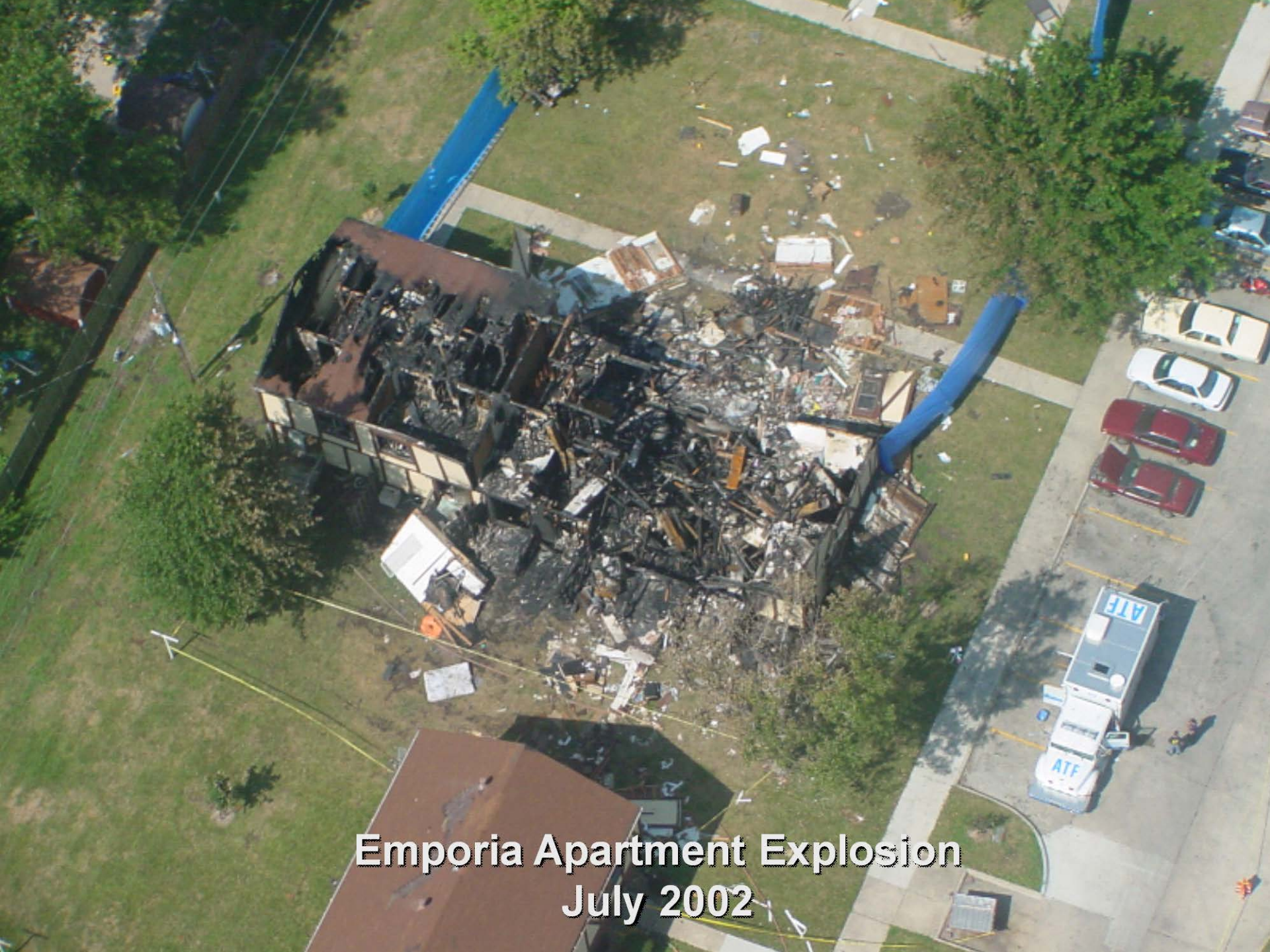
Emporia Apartment Explosion July 2002