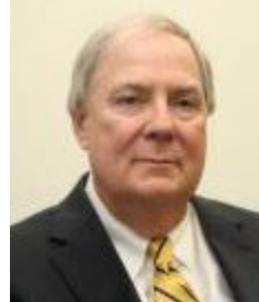
Dwight D. Keen Commissioner